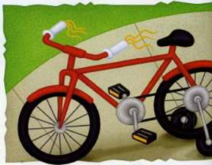
4. a bicycle