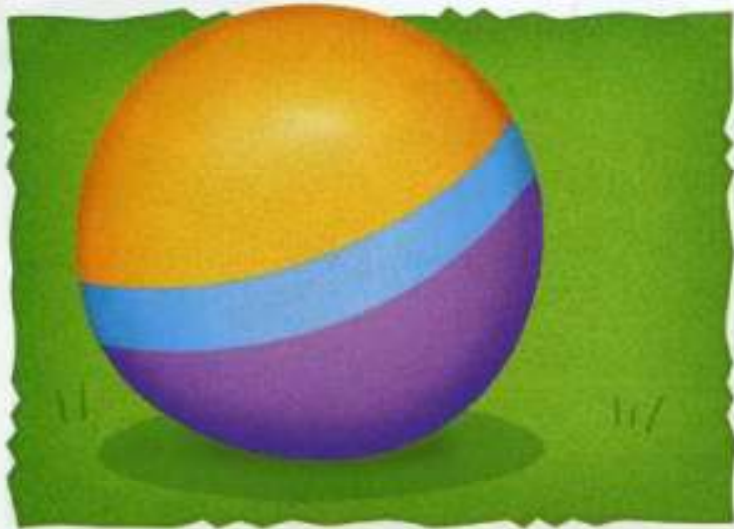
1. a ball