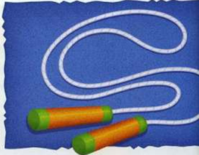
2. a jump rope