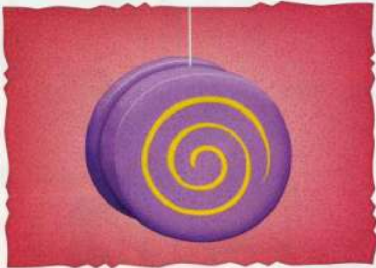
3. a yo-yo